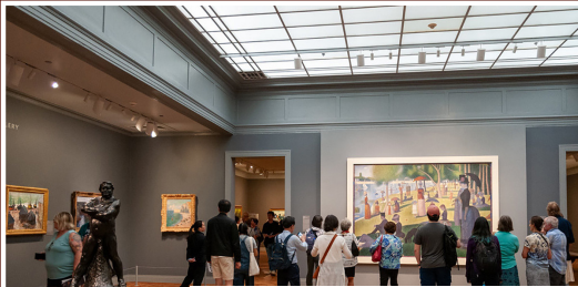
The Art Institute of Chicago