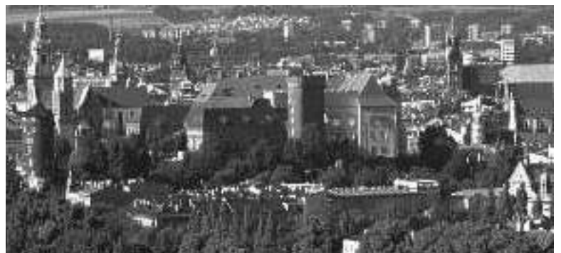
The Sofitel Forum Hotel across the Vistula from the Wawel Royal Castle Complex