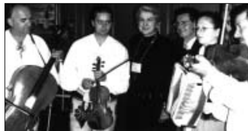
Goral Folk Quartet entertains the convention participants at a reception on the first night of the convention