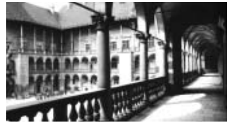
The colonnaded inner courtyard of Wawel Castle