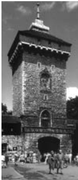
St. Florian's gate, part of the remaining city walls

phone: 410-798-7512 fax: 410-798-7513 e-mail: rwierman@aol.com