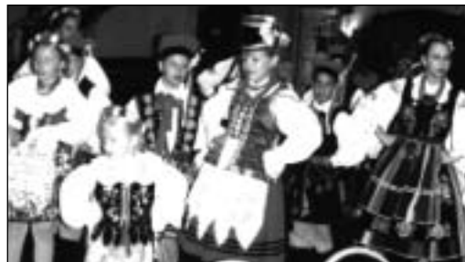
Youngsters in Polish folk dress greet the convention participants with song and dance

That evening the delegates and guests met for dinner on the 95th floor of the Hancock Building and realized that they were literally floating amongst the clouds. Shortly, the fog lifted and the diners